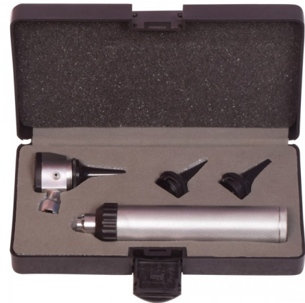
Fig- 0, Fig- 1, Fig- 2, Fig- 3, Fig- 4