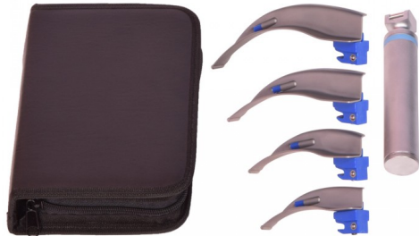
Fig- 0, Fig- 1, Fig- 2, Fig- 3, Fig- 4