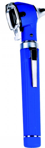
Mini Otoscope Fiber Optics

Fiber Otoscope, Lock fitting, brass chrome plated, lens x 4, Plastic Pneumatic otoscopy port, 2.5V lamp, rheostt button, ine black plastic disposable speculas (3 each size) in a plastic case