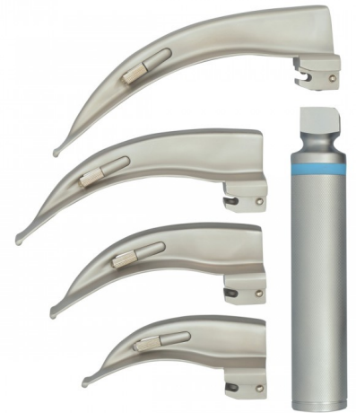
Fig- 0, Fig- 1, Fig- 2, Fig- 3, Fig- 4