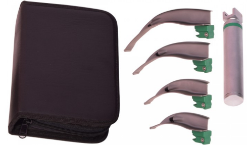
Fig- 0, Fig- 1, Fig- 2, Fig- 3, Fig- 4