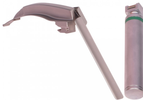
Fig- 0, Fig- 1, Fig- 2, Fig- 3, Fig- 4