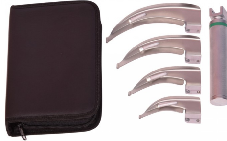
Fig- 0, Fig- 1, Fig- 2, Fig- 3, Fig- 4