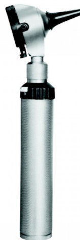
Metal Body Otoscopes

Pin contact / Screw fitting, brass chrome plated, double lens (lens- x1 & lens x 4), metal Pneumatic otoscopy port, 2.5V lamp, rheostsat button, three black plastic reusable speculas